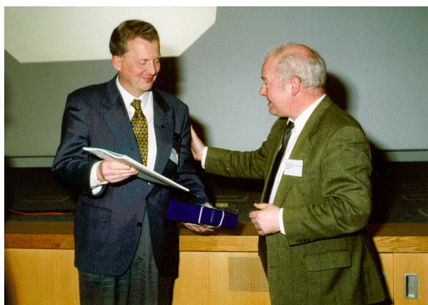
Figure: Handing over the presidency of EUROLAB